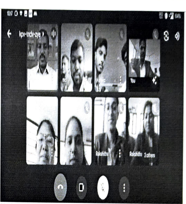
WORKSHOP ON SPSS